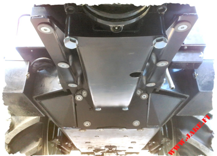
With JAKE Engine Armour