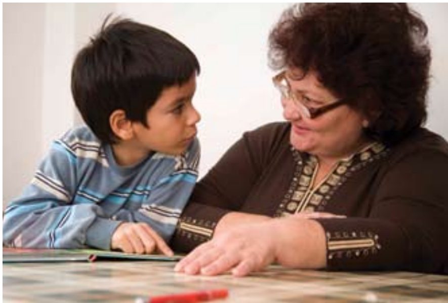
Figure 4. A six-year-old boy, previously a resident of a Romanian home for abandoned children, gets loving, one-on-one attention from his adoptive mother in their family apartment in Bucharest in 2007. Mother and son began their relationship as foster mother and foster son when the 11-month-old boy was removed from an institution and placed in her home.

havior and seeking closeness and comfort from a parent/caregiver rather than a stranger.