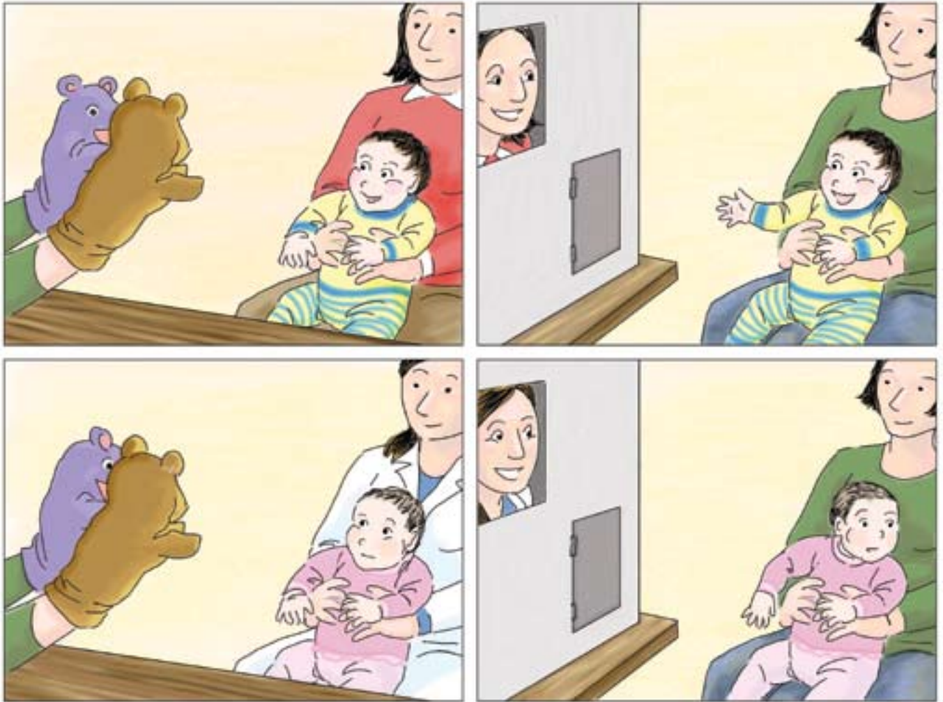
Figure 3. Psychologists can grade young children's emotional states and attention responses by observing their reactions to hand puppet play and a peek-a-boo game, activities that delight most youngsters. In the upper panels, a baby responds in expected ways. In those below, a child displays less positive emotion and less attention to the normally amusing spectacles before her, responses more common among institutionalized children observed in the Bucharest Early Intervention Project.

period, the opportunity to establish binocular vision is lost.